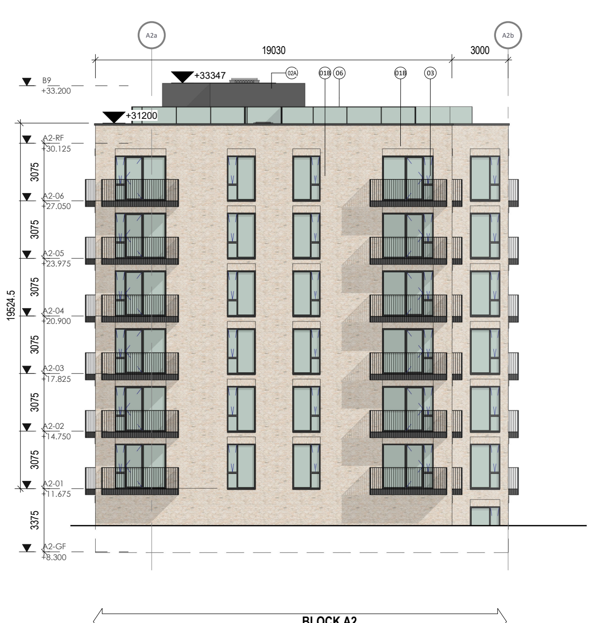
3 Block A2 - South 1 : 200