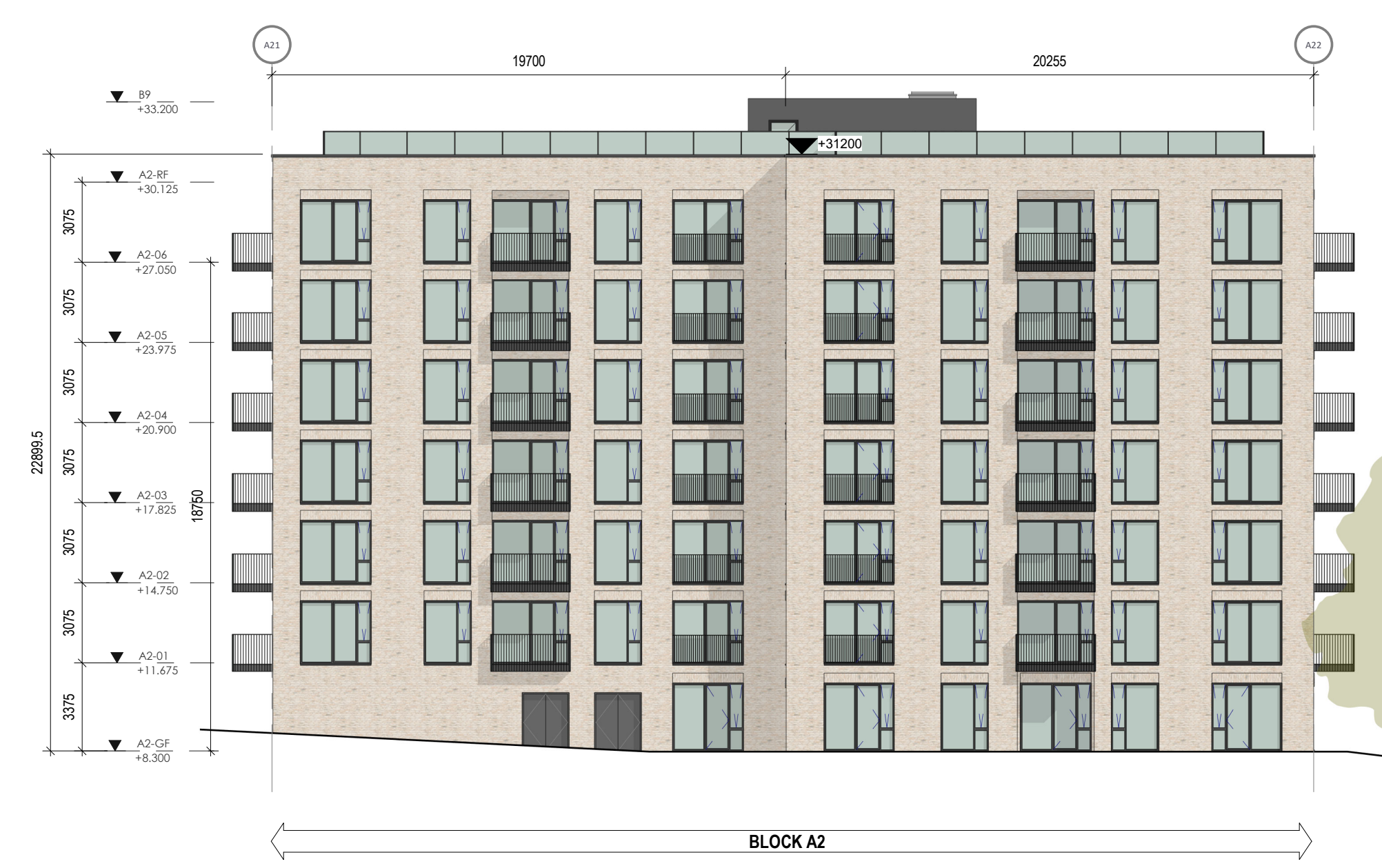
1 Block A2 - East 1 : 200