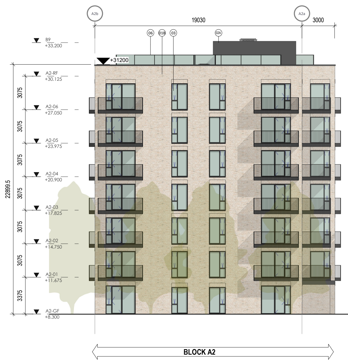
2 Block A2 - North 1 : 200