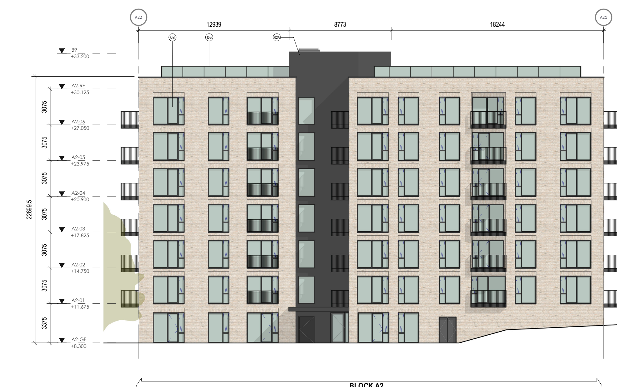
4 Block A2 - West 1 : 200